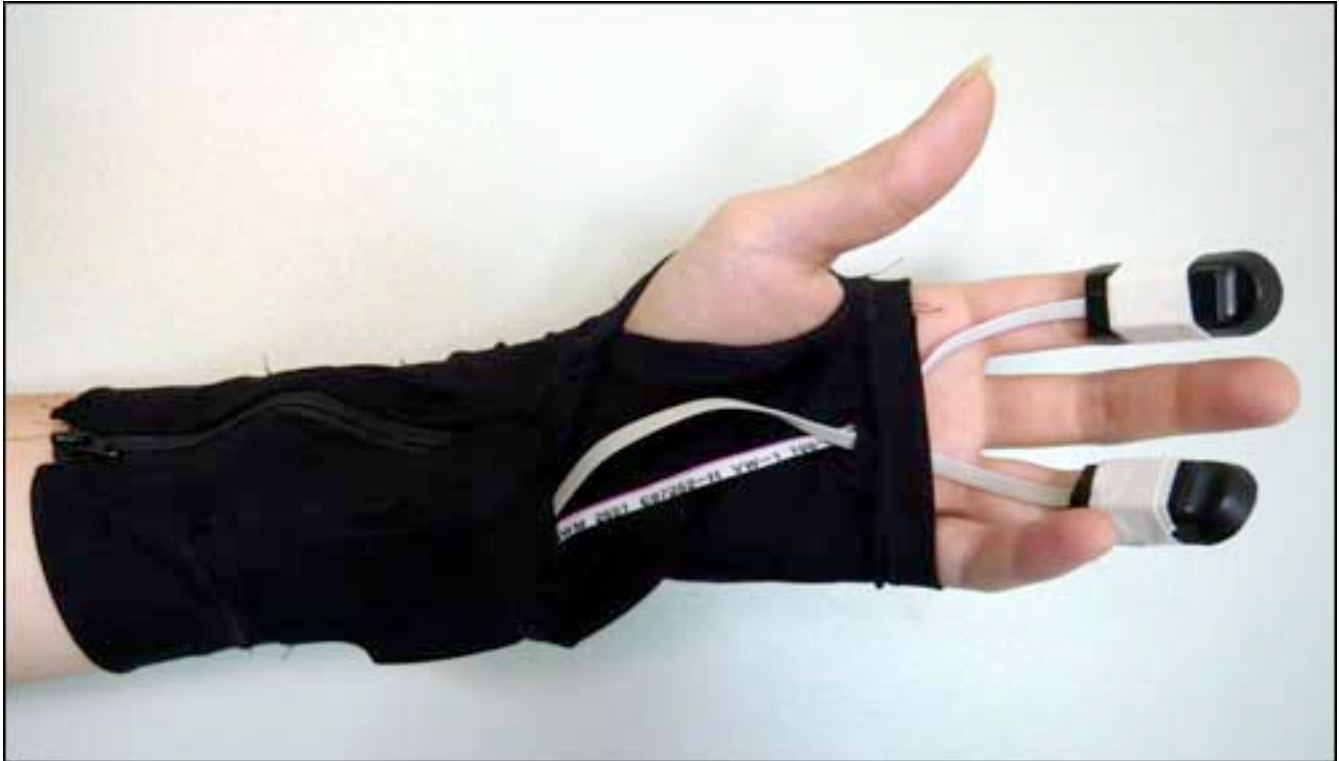
Each glove contained a Ubisense active RFID tag, as well as wireless sensors that tracked the electrical conductivity of the wearer's skin, as well as pulse.

The RFID tags transmitted the location data to Ubisense Series 7000 RFID readers, then forwarded that information to Ubisense's Location Platform, which has standard application programming interfaces (APIs) that can export the data to other applications. The biometric data was transmitted via wireless LAN to a MySQL database, where it was merged with the location information. The location data was then used to determine which specific artworks the visitor had been viewing, and how long that individual had looked at each piece. By pairing the location and biometric data, the researchers could measure a participant's biological and cognitive reaction to each work of art.