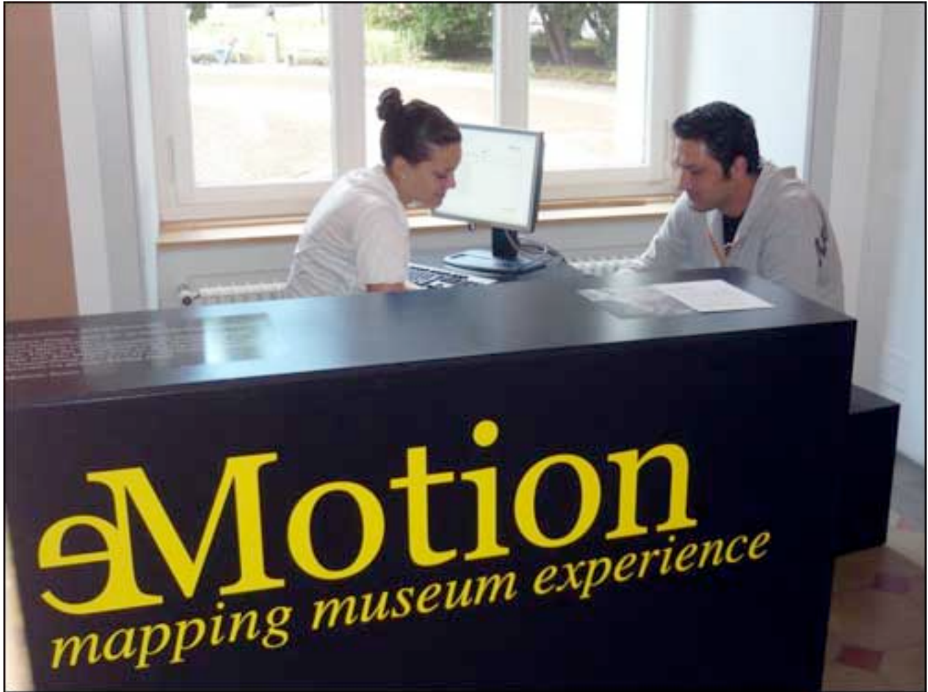
Prior to entering the exhibit, eMotion participants were asked a series of questions.