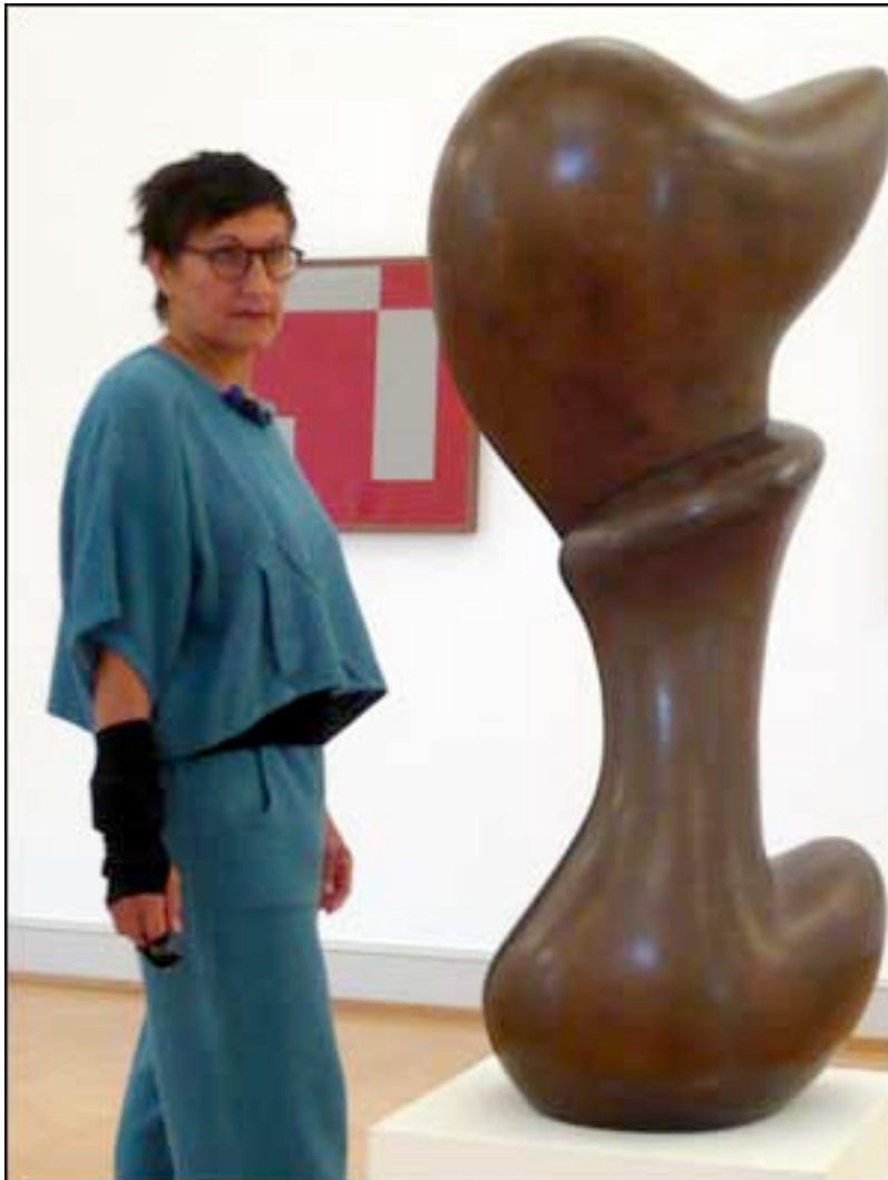
A glove-earring visitor

The researchers say they chose the Ubisense RFID solution because of the accuracy it provided. "I spent six months looking at various location-tracking technologies—RFID, wireless LAN, video-tracking and so on," Greenwood says. "And they all had their advantages and disadvantages. But the critical point for us was to cover the museum space with an accuracy of plus or minus 10 centimeters [4 inches], which only Ubisense could offer."